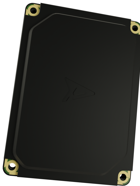
Figure 2: Phantom Forge® encapsulated module (XIPHOS-X3 / XIPHOS-X4).